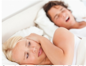
Snoring Can Kill - Stop It Tonight