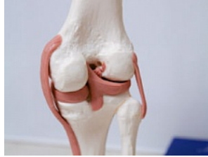
Surprisingly simple solution to help your joints. See why these ingredients are flying off shelves