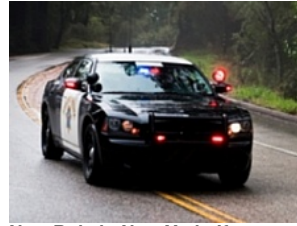
New Rule in New York: If you pay for car insurance you better read this...