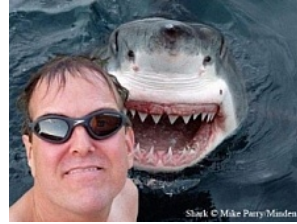
Amazing, Hard-to-Believe, Perfectly Timed Pictures - Taken at Just the Right Moment!