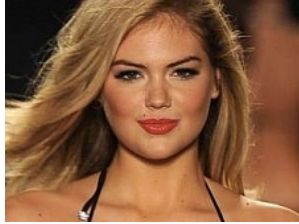
Kate Upton's thoughts on Her Breasts