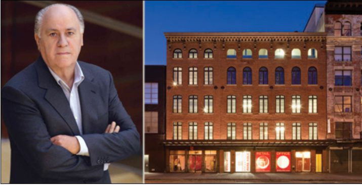
Amancio Ortega and 414 West 14th Street

Ponte Gadea Group, the U.S. investment arm for Spanish billionaire Amancio Ortega, has acquired a 56,000-square-foot office and retail building at 414 West 14th Street for $94 million, according to public records filed with the city today.