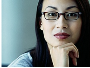
Monitor your credit. Manage your future. Equifax Complete™ Premier.